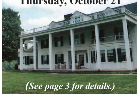
(See page 3 for details.)