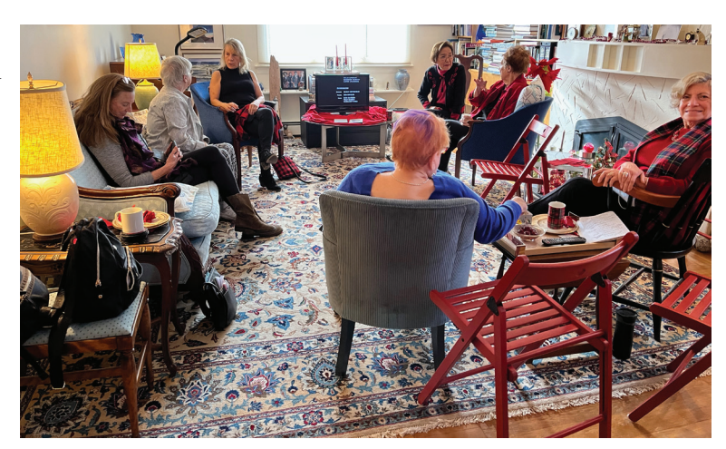
The Film Group gathers for a hybrid meeting using Zoom.

Tennis and Golf activity groups remained on hold, with hopes of being able to play in person in 22/23 season.